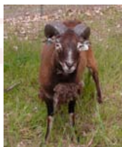
Son Holloway, 3 yrs.