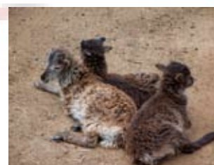
Triplets, 2008 (Hannah, r.)