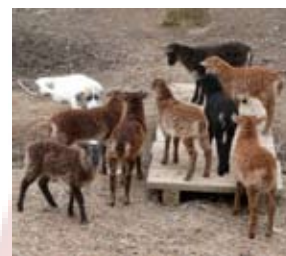
Ash and Quentin's lambs, 2011