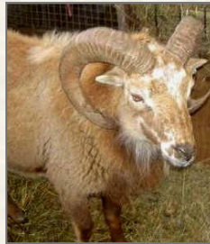
A handsome mane

Along with changes in temperament, there are changes in behavior. They rub their horns on nearly everything and what they don't rub, they bash. Water pipes and faucets