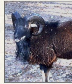
A rugged ruff

alpha leader and treat you as he would any other adversary. Ironically, it is the friendliest ones you need to be most vigilant about. Stomping your foot, as an ewe does when she is threatened, is generally respected and they will back away. It is recommended that you carry a stick when dealing with rams. Not necessarily as a weapon, but to deflect their attention and even for self-defense. You do not need to be afraid of your rams, but you need to be alert and use common sense when working with them at this time of the year.