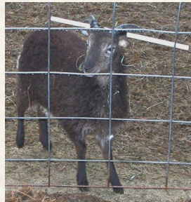
Fiona's new horns

horns have grown to the point they can force their heads out through the wire but cannot pull them back in. Obviously, this can lead to disaster, and if you have field fence vigilance is vital. One lamb, Fiona, forced me to come up with a creative solution to the problem. By resting a 28" length of ½" PVC pipe across her head and securing it to the back of her horns with electrical tape I was able to make her head too wide to get through the fence. Horns must mean something special in the sheep world, because