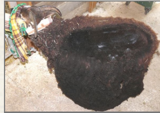
Fleece bends over from its weight

handed, I have left-handed shears. I also had the wormer and foot trimming shears and antibiotic spray (which you do not have in America) within reach. Some shearing (yearling) ewes had shed most of their wool, more than the older non-breeders who are more likely to hang onto their fleece. The sheep were run into the pen one at a time to be checked, spare fleece taken off, foot trimmed if needed, and wormed.