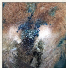
Crovet brings maggots to wool's surface