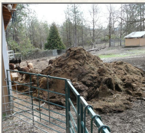
A mountain of muck

of coccidea contamination is part of having sheep. Ewes carry the parasite and shed it in its infective stage through their manure; transmission occurs via oral ingestion of the eggs. Efforts to reduce this in the environment can