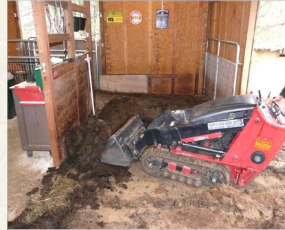
The Toro Dingo at work.

Though it was critical to clean out the barn, I had no